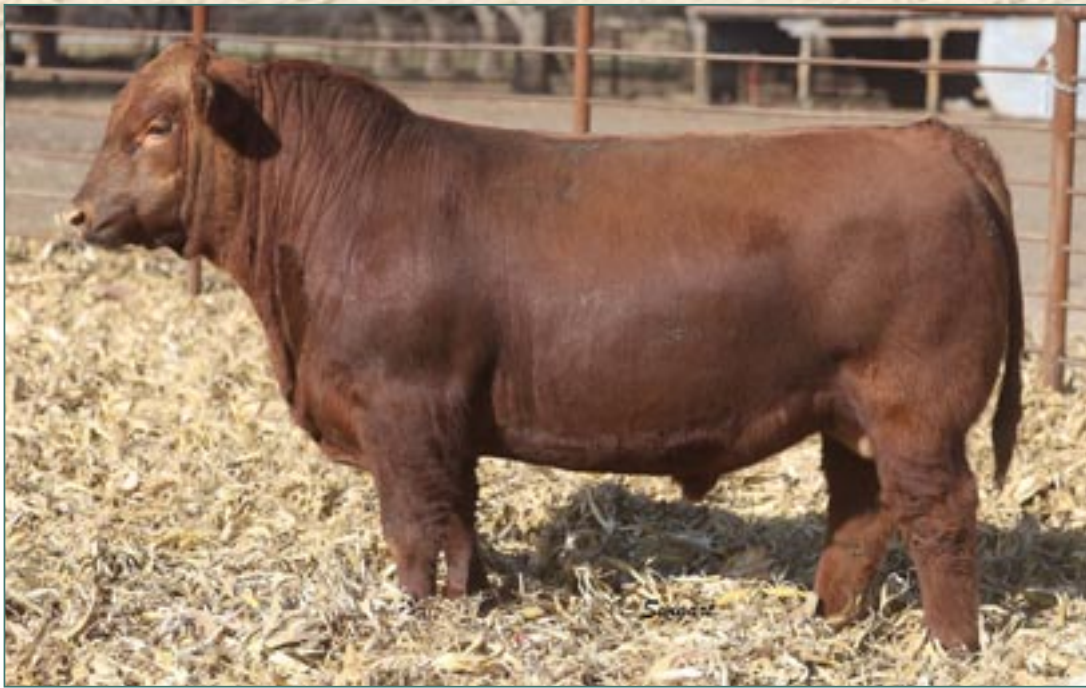
YCRA Hot Blooded KF46 • Lot 14