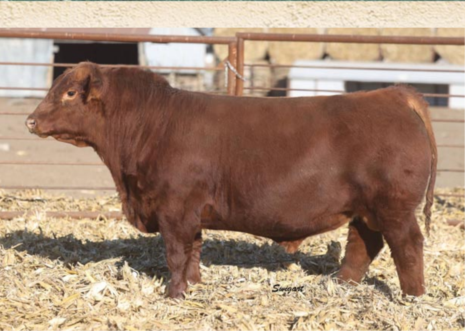
YCRA Foreigner KF44 • Lot 1