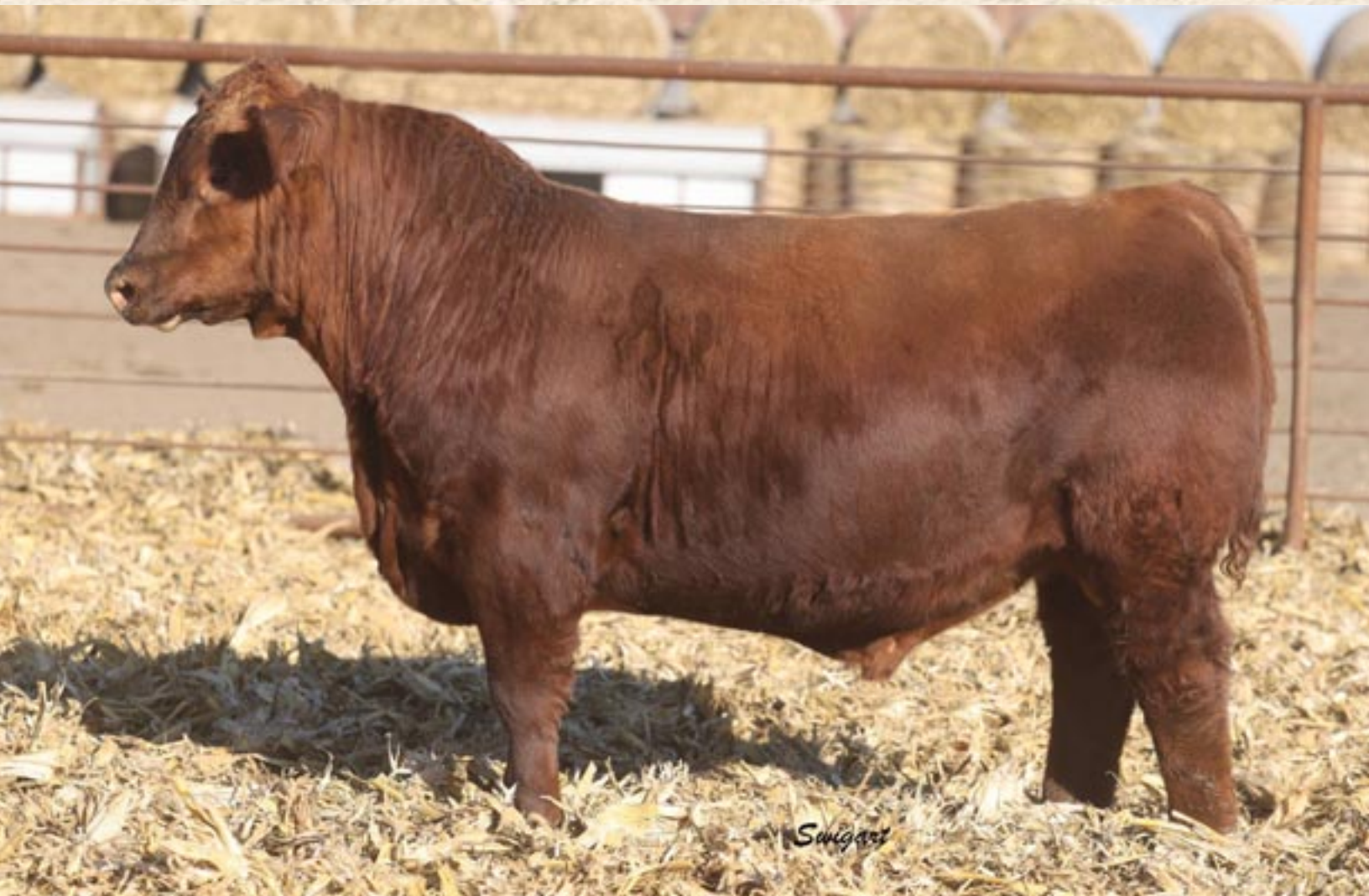
YCRA Red Box KF31 • Lot 20