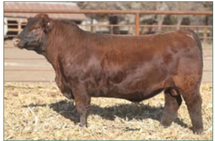
YCRA Stockbroker KF124 • Lot 26

Consistency is king in cattle breeding, and great cow families are the ones that year in and year out are showing up and turning heads in the bull sale catalog. Look back and you'll notice this pedigree in another sale feature, lot 12. With an impressive birth to weaning spread and the calving ease built in, he should be a highly versatile breeding piece. Heifer Bull • Top 15% CED, ME, HPG, and YG