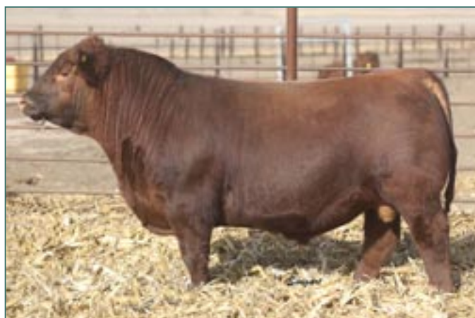
YCRA Stockbroker KF5 • Lot 22