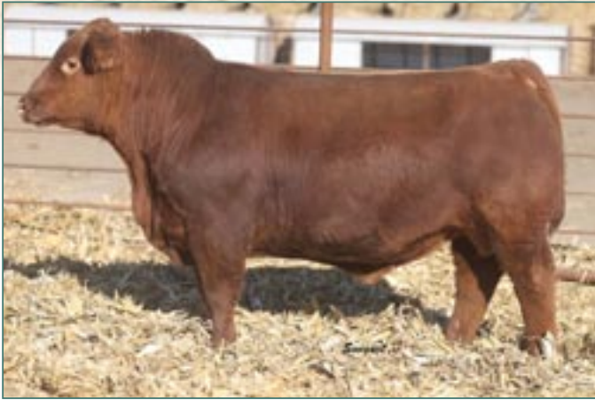
YCRA KF85 • Lot 30