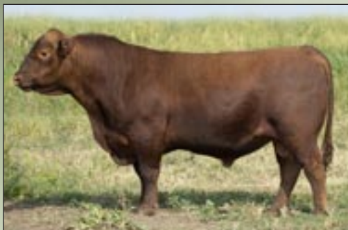
YCRA FOREIGNER FH10 #4424369

ProS 83, HB 34, GM 49, CED 10, BW -1.8, WW 75, YW 123, ADG 0.30, DMI 1.58, Milk 16, ME 2, HPG 12, CEM 6, Stay 11, Marb 0.51, YG 0.07, CW 26, REA 0.20, Fat 0.03