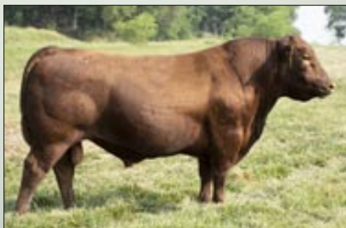
RED OLE CROWFOOT 689H CAN#2189991

GM 30; CED 10; BW 2.2; WW 64, YW 106 ADG 0.26; DMI 1.64; Milk 33, ME 2; CEM 5; Stay 15; Marb 0.33; YG 0.02; CW 20; REA 0.18; Fat 0.01