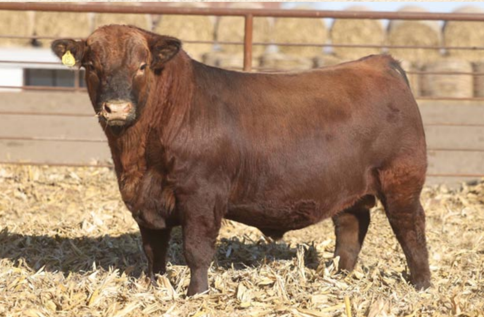
YCRA Hot Blooded KF18 • Lot 10