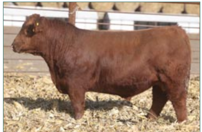
YCRA Depth Charge KF131 • Lot 36