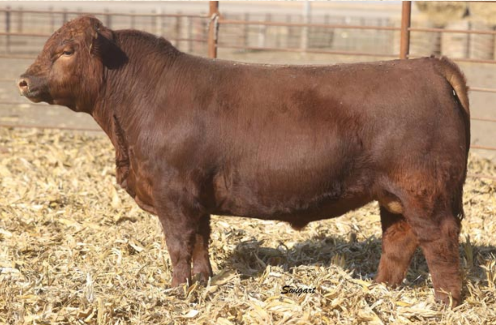
Y CRA Hot Blooded KF22 • Lot 18