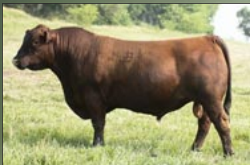
MLK CRK ADMIRAL 1245 #4459291

Calved: 02/19/2023 • Sire: MLK CRK Admiral 1245