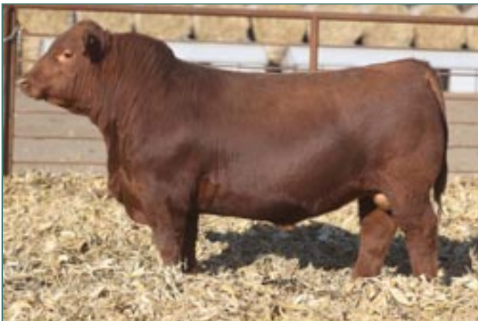
YCRA KF21 • Lot 31

By far the most rugged and muscular of the Depth Charge sire group, this bull also finds his way to the front of the pack because of the tremendous cow behind him. We have another son in the herdsire lineup. He could likely be used successfully on a set of larger framed heifers. Top 11% ME