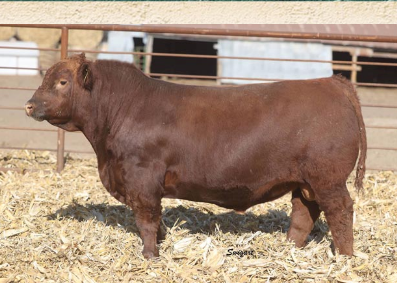
YCRA Foreigner KF29 • Lot 2