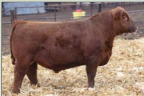
YCRA STOCKBROKER K24 #4727171

ProS 91, HB 81, GM 11, CED 14, BW -2.0, WW 59, YW 87, ADG 0.18, DMI 1.29, Milk 25, ME -6, HPG 16, CEM 8, Stay 16, Marb 0.34, YG 0.03, CW 7, REA 0.03, Fat 0.02