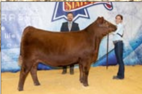
Dam of Lot 39