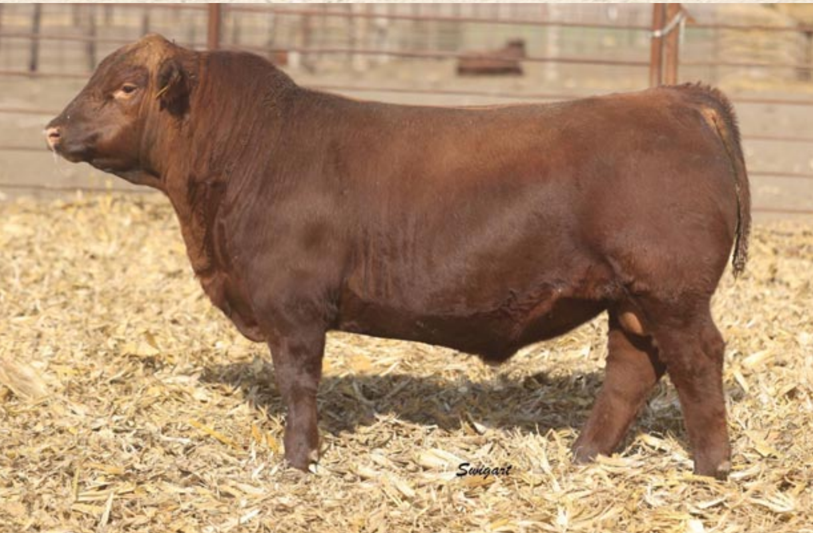
YCRA Foreigner KF66 • Lot 5