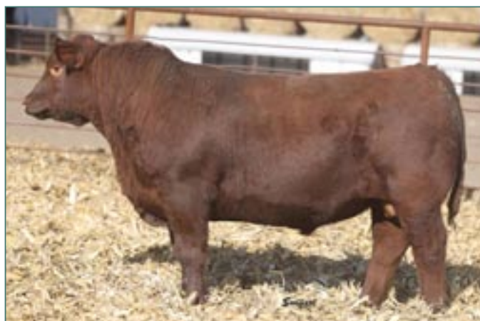
YCRA Stockbroker KF13 • Lot 23