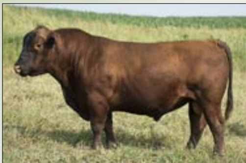
YCRA FOREIGNER FH12 #4424335

ProS 77, HB 47, GM 30, CED 14, BW -3.1, WW 66, YW 104, ADG 0.24, DMI 1.39, Milk 18, ME -3, HPG 13, CEM 7, Stay 12, Marb 0.38, YG 0.05, CW 19, REA 0.16, Fat 0.03