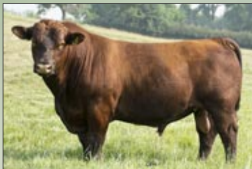
YCRA STOCKBROKER H30 #4355543

ProS 146, HB 77, GM 69, CEM 11, BW -3.3, WW 57, YW 108, ADG 0.31, DMI 1.65, Milk 24, ME 8, HPG 20, CEM 4, Stay 19, Marb 0.48, YG 0.27, CW 46, REA 0.35, Fat 0.09