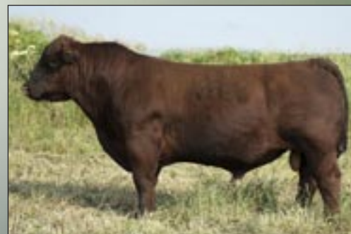
RED OLE OSCAR 429H CAN#2190019

ProS 55; HB 10; GM 45; CED 8; BW -0.5; WW 59; YW 95; ADG 0.23; DMI 1.20; Milk 22; ME -2; HPG 10; CEM 3; Stay 10; Marb 0.42; YG 0.07; CW 27; REA 0.14; Fat 0.02