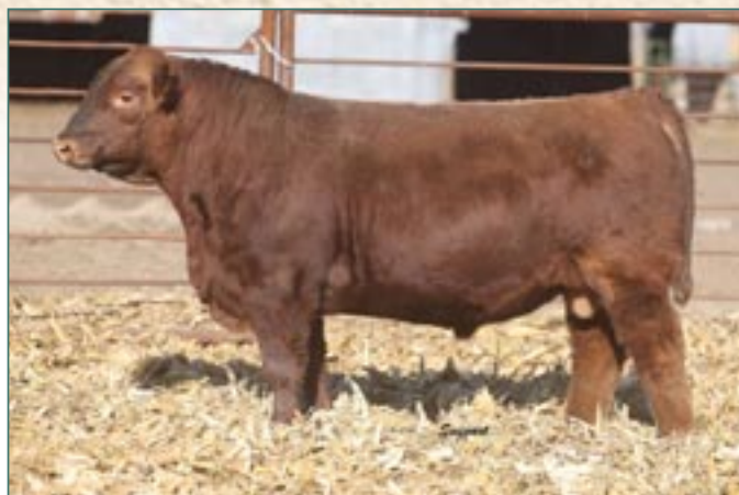
YCRA Foreigner KF37 • Lot 21