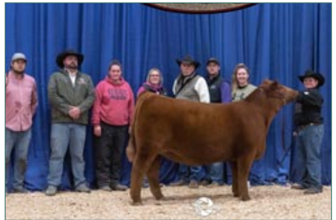
Rojas Queens Tea 9303 • Dam of Lots 42-44