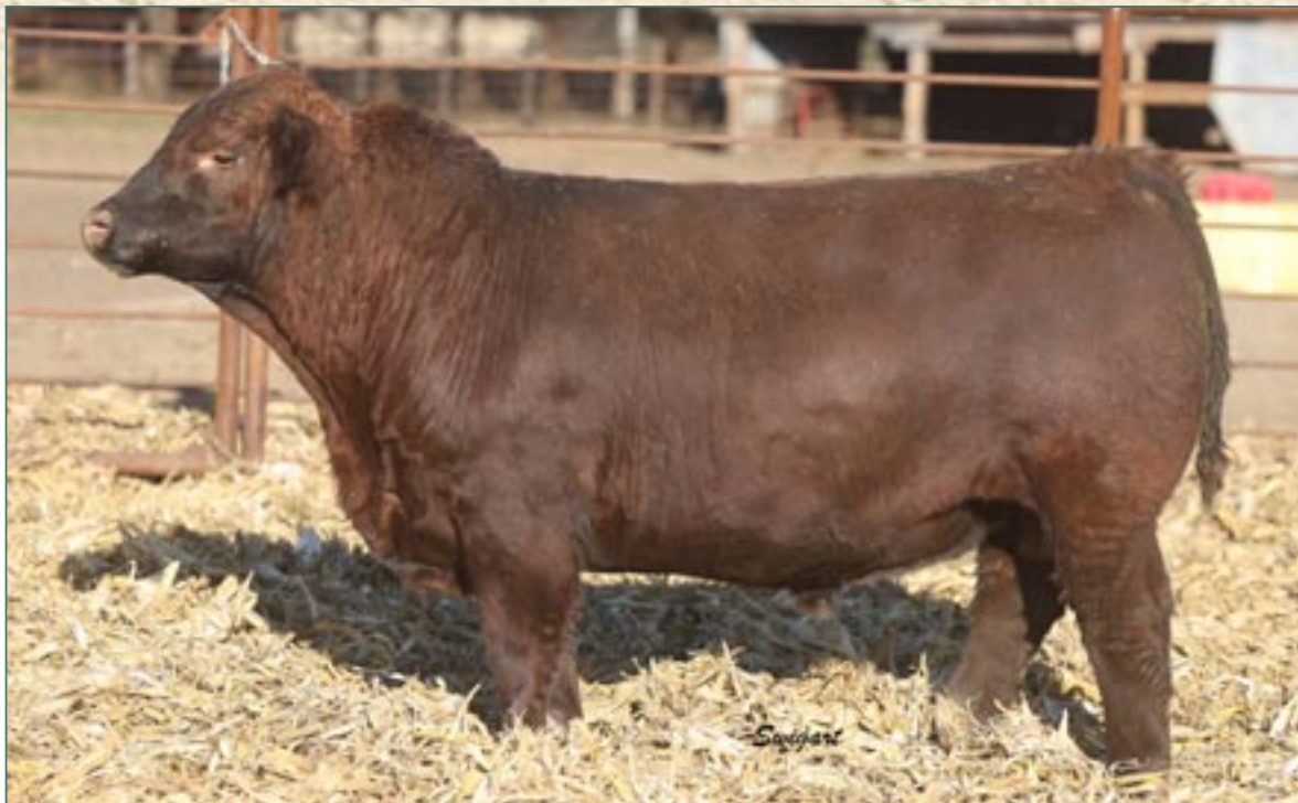
YCRA Foreigner KF8 • Lot 8