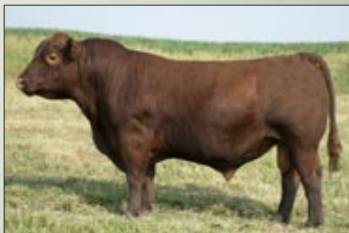
RED DKF RED BOX 29H CAN#2163709

ProS 69, HB 58, GM 11, CED 12, BW -1.5, WW 65, YW 99, ADG 0.21, DMI 1.37, Milk 27, ME -2, HPG 14, CEM 6, Stay 15, Marb 0.24, YG 0.02, CW 14, REA 0.17, Fat 0.02