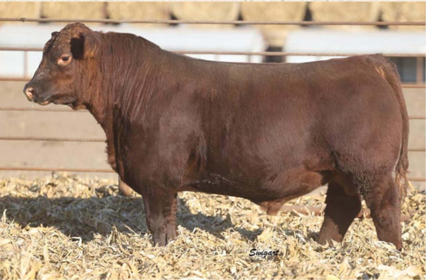
YCRA Foreigner KF36 • Lot 3