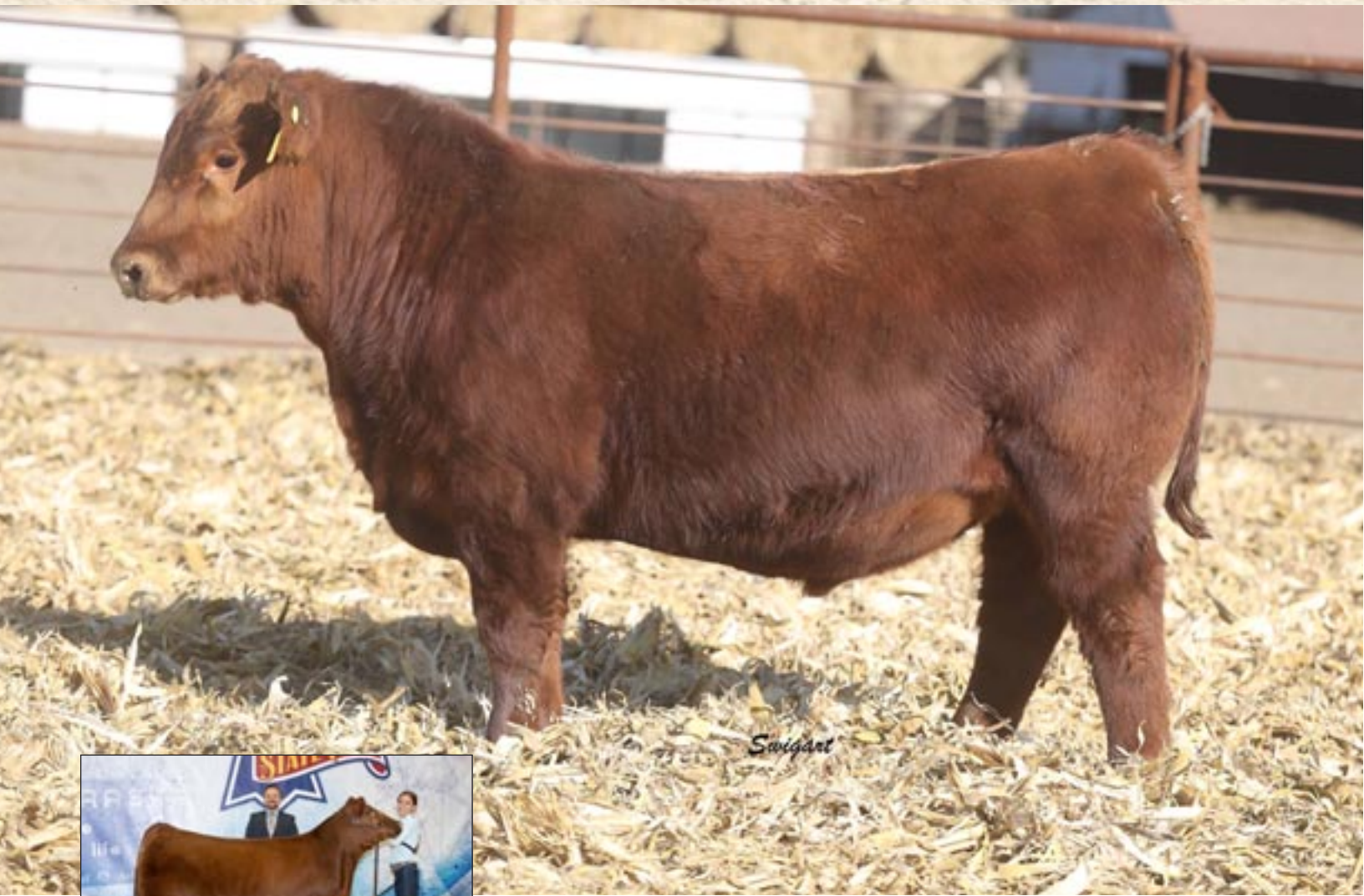
YCRA Red Raptor L104 - Lot 39 Pictured at 10 months