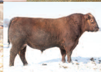
CSPF Ace Sire of Lot 1