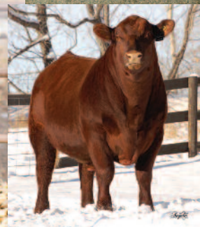
Red Lazy MC Trooper 21Y Sire of Lots 7-8 & 22