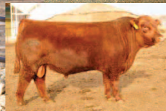
BUF CRK The Right Kind U199 Sire of Lots 13-14