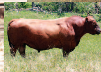
Brown JYJ Revelation X1267 Sire of lot 6