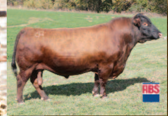
Brown Ultimate X7752 Sire of Lots 9-10