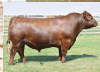
Andras New Direction R240 Sire of Lots 3 & 21