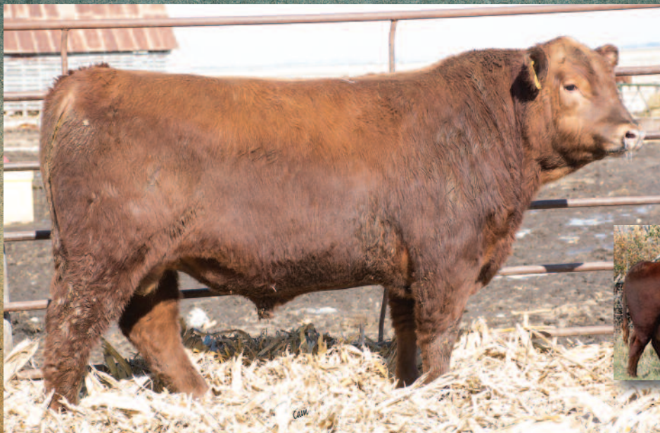
Red Six Mile Timberline 880W Sire of Lot 12