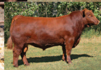
Red Lazy MC CC Detour 2W Sire of Lots 5 & 11