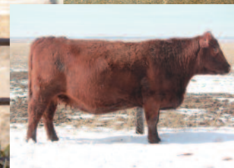
C-Bar Lakota W936 Dam of Lot 19