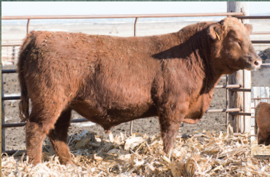
YCRA Perfect Storm C39 Maternal Brother to Lot 14