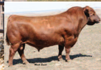
Beckton Epic R397 K Sire of Lot 4