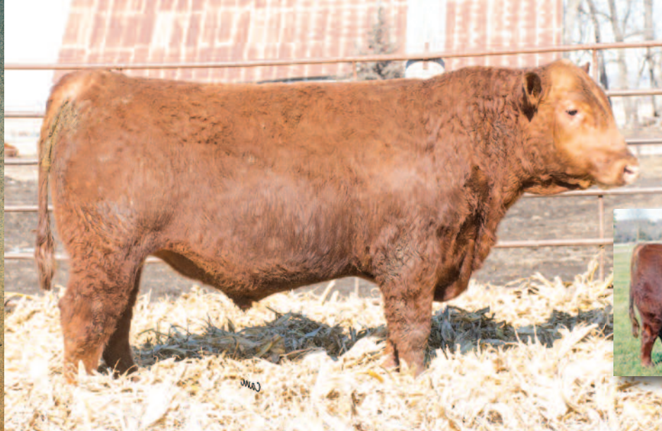
Brown JYJ Redemption Y1334 Sire of Lots 17-18 & 24