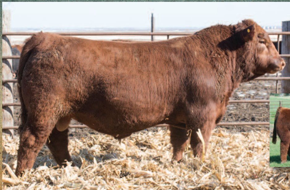
PZC TMAS Firestorm 1800 ET Sire of Lots 15-16